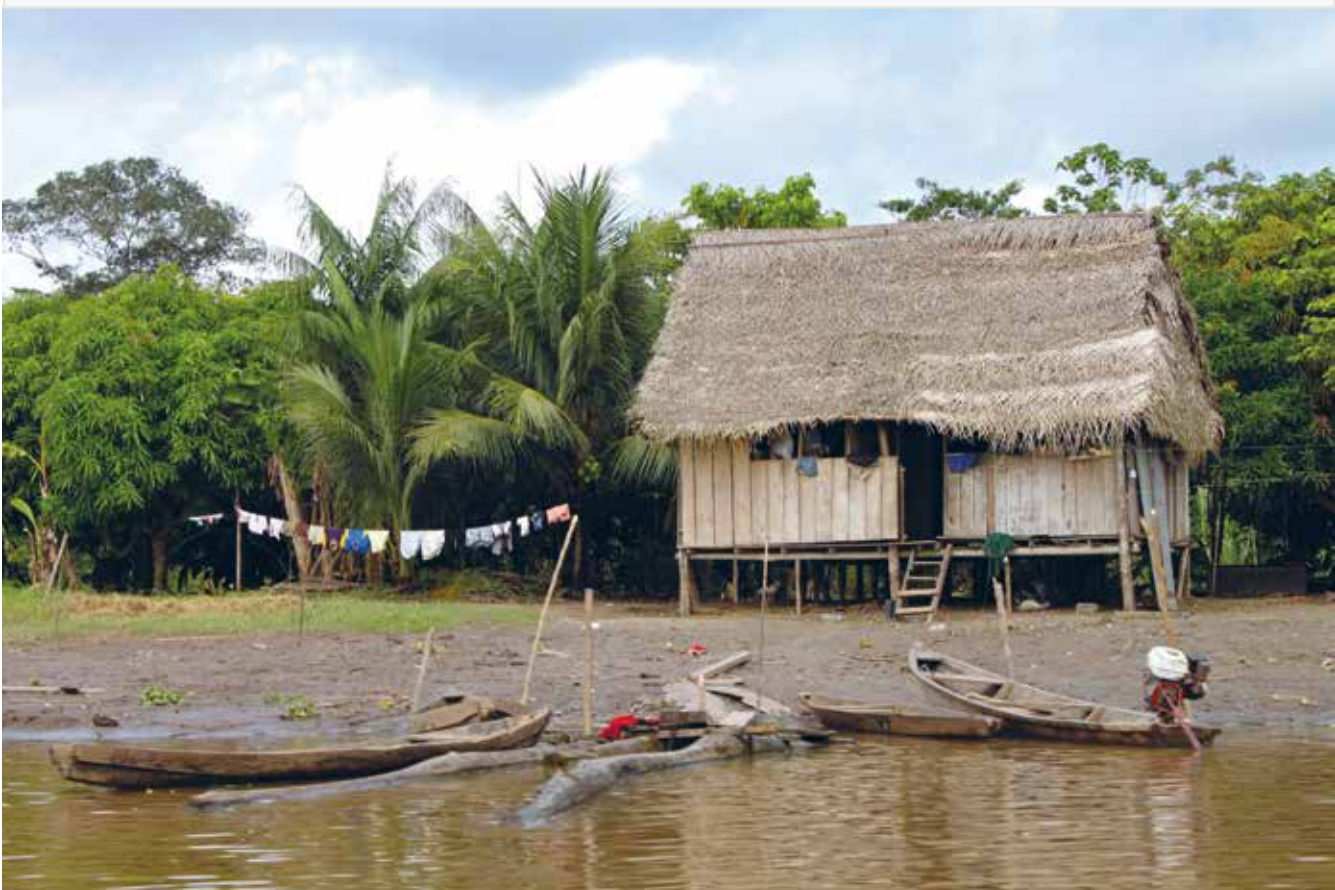
Eli Duke / Flickr CC BY-SA